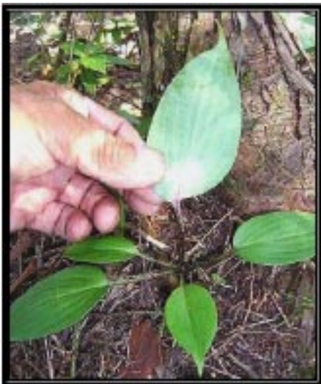
In the Forest of Chichibu, Japan Uragibosan longipes f. hypoglauca At Hosta Hill Garden