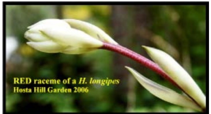
RED raceme of a H. longipes Hosta Hill Garden 2006