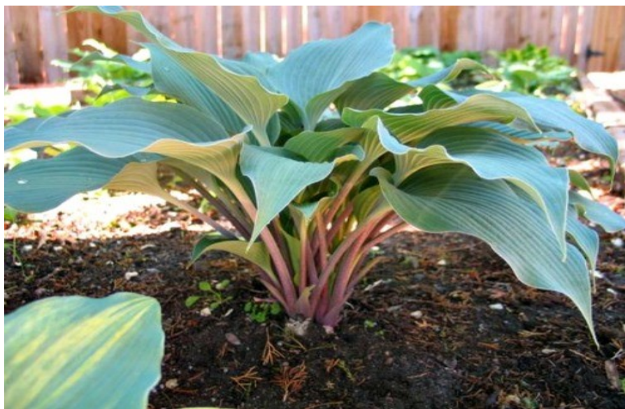
Evening Blush Hosta