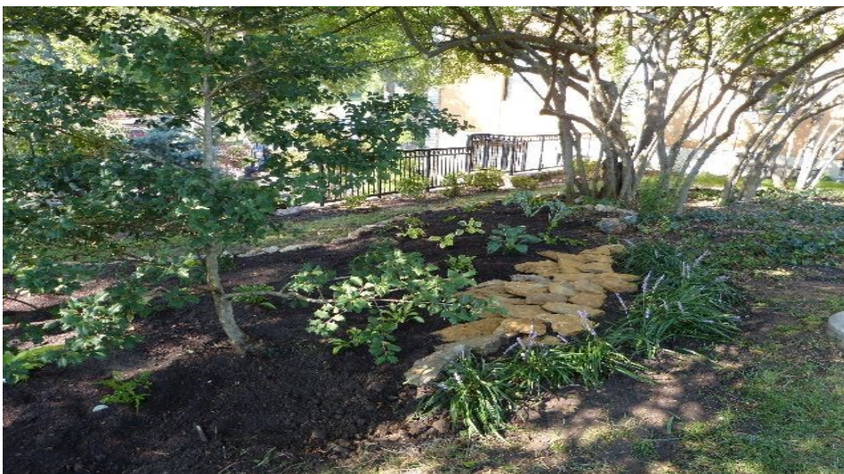
HH&SPS Garden at Loose Park